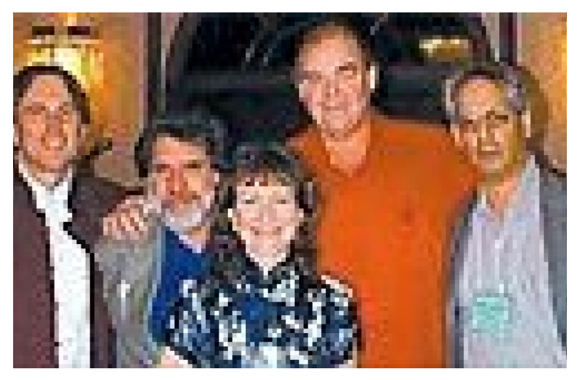
BILLING / FEES / INSURANCE