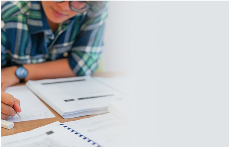
PRACTICE & PROFESSION