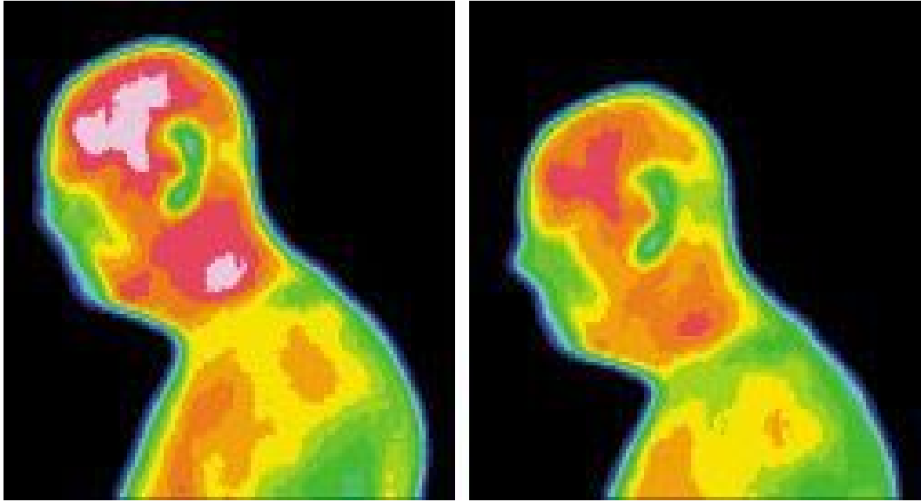
Fig 3. Infrared images for subject brain tumor before (left) and 15 minutes after (right) drinking double-helix water. The maximum temperature of the head before is 34.0C and the maximum temperature after is 33.5C. This is statistically significant.

If the stable water clusters are misaligned, the meridian will not function properly. Qi will not flow smoothly. An acupuncture needle inserted in the meridian will cause the muscle to restore the straight-line status of the meridian. Qi then flows smoothly and the body functions properly.