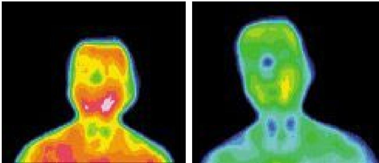
Fig 2. Infrared images for diabetes subject before (left) and 15 minutes after (right) drinking double-helix water. The maximum temperature of the face before is 36.2C and the maximum temperature after is 34.8C. This is a huge reduction in temperature.

Second, the double-helix water contains stable water clusters that are shaped like DNA, which passes on from generation to generation. Double-helix water might be the precursor of DNA and have to do with why a biological entity is alive.